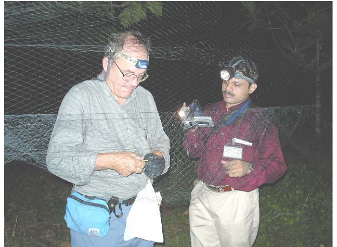
Releasing a bat from mist net without pain to either man or animal

of bats. Examples of cryptic species have been discussed in light of the methods used for identification of problem species or subspecies pairs. Echolocation calls of Pipistrellus species of United Kingdom fall in the same range but the DNA analysis showed at least 11% divergence between the species.