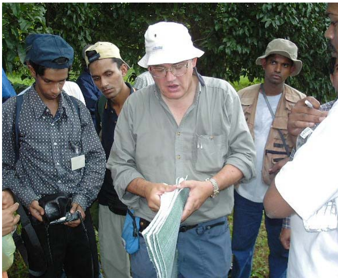
Mats for collecting bat faeces for analysis

Later, participants collected specimens of Greater Short-Nosed Fruit Bat Cynopterus sphinx in the nets and learned to remove the netted bats without causing them any pain or injury. A few animals were taken back to the venue to show participants how to take morphometric measurements before releasing.