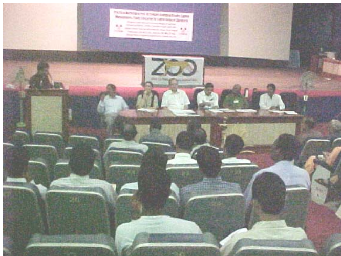
Inaugural function in the KAU auditorium.