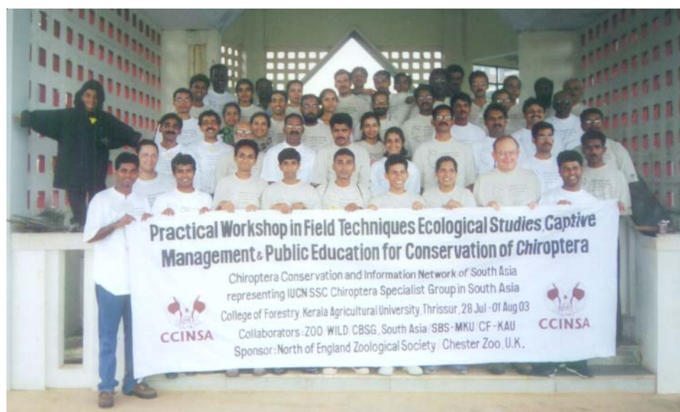
Participants pose with the world's largest bat (see hovering figure, left).

Hipposideros diadema (E. Geoffroy, 1813) -- VU Hipposideros durgadasi Khajuria, 1970 -- EN Hipposideros hypophyllus Kock & Bhat, 1994 -- EN Ia io Thomas, 1902 -- EN Miniopterus pusillus Dobson, 1876 -- VU Murina grisea Peters, 1872 -- CR Myotis annectans (Dobson, 1871) -- VU Myotis blythii (Tomes, 1857) -- VU Myotis daubentonii (Kuhl, 1819) -- EN Myotis montivagus (Dobson, 1874) -- VU Myotis mystacinus (Kuhl, 1819) -- VU Myotis sicarius Thomas, 1915 -- EN Nyctalus leisleri (Kuhl, 1819) -- EN Otomops wroughtoni (Thomas, 1913) -- CR Philetor brachypterus (Temminck, 1840) -- EN Pipistrellus savii (Bonaparte, 1837) -- VU Rhinolophus cognatus Andersen, 1906 -- VU Rhinolophus ferrumequinum Schreber, 1774 -- VU Rhinolophus hipposideros (Bechstein, 1800) -- VU Rhinolophus mitratus Blyth, 1844 -- VU Rhinolophus subbadius Blyth, 1844 -- VU Rhinolophus trifolius Temminck, 1834 -- VU Rhinolophus yunanensis Dobson, 1872 -- VU Taphozous theobaldi Dobson, 1872 -- VU