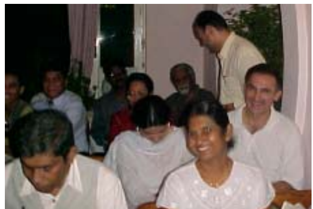
Participants finding a lot to smile about at the first get-together at Clarion Hotel.

The invitation of Sri Lanka to host the next meeting (official permission pending but