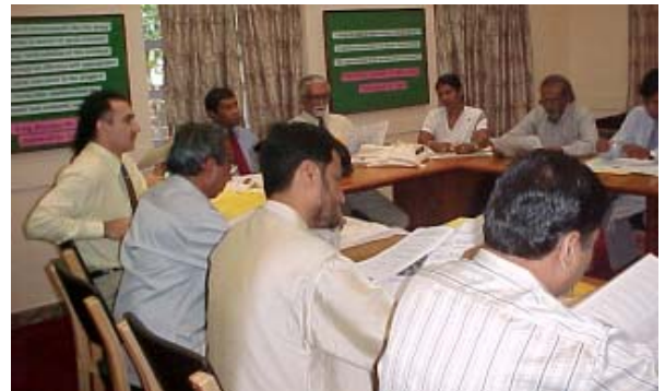
Participants contributed information about their animals