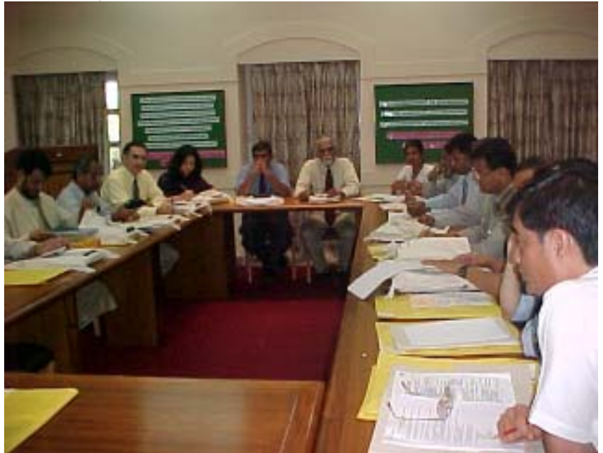
The whole group meeting -- discussion of South Asian Zoo problems and prospects