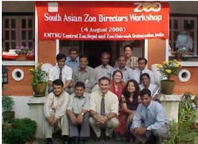
Zoo managers, veterinarians, curators and educators from Bangladesh, India, Pakistan, Sri Lanka and Nepal

Many of these zoo officials lived in the same country but had not met before, so it was an incredibly touching and moving occasion. The atmosphere was weighted with excitement and happiness at finally coming together which no one was shy to express.