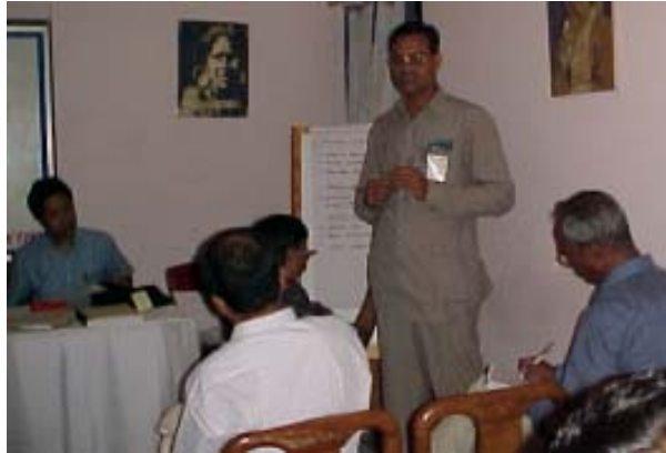
Participants share their hopes for the meeting at the first introduction.

The South Asian zoo meeting evening ice-breaker, Hotel Clarion, 3 August 2000