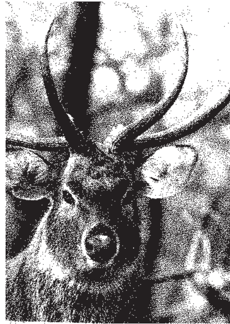
Cervus eldi eldi

Through the efforts of the Forest Department of Manipur the area is now a National Park. Vigorous protection measures have ensured the steady increase of the Sangai wild population to about 137 individuals (1994). In many respects, survival of the Sangai is dependent on the goodwill of the people of the area — and their willingness to make some sacrifices for this unique species.